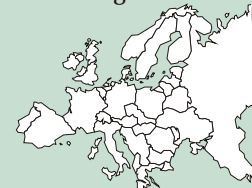
Ian takes on Europe