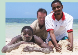
The team go on retreat!