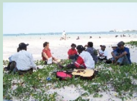
Nairobi Baptist Association Youth Camp