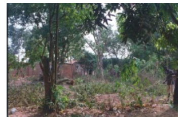
The compound - before!

Work has been continuing on the new house and compound. The initial push was to secure the site with a wall and this has seen significant progress.